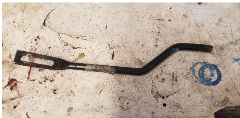
I found a cut off piece of shift linkage that worked perfect for me